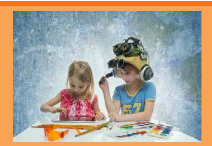
I want to learn by exploring my world and trying many different activities.