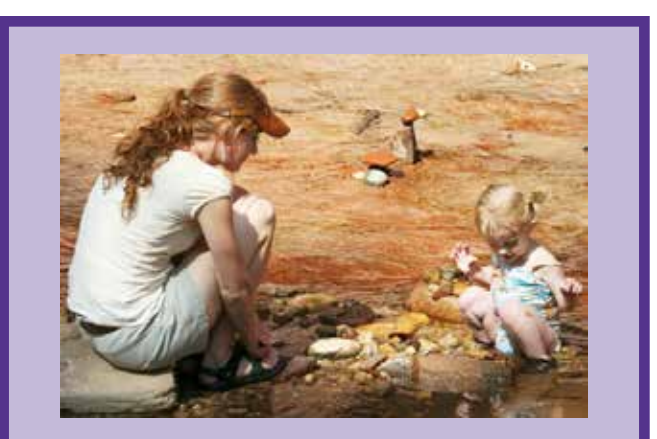
Spend time with me outside exploring the natural world and talking about what I discover.